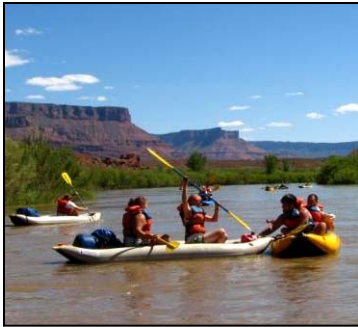
Morningside College students having fun on a multi-day kayak trip with us on the Colorado River as part of a class in Desert Ecology

Service, Science, Education and Exploration since 1995