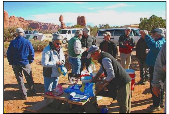
Making new friends and enjoying lunch at Balanced Rock on the Arches geology tour