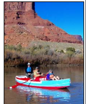
A replica boat on the River Rendezvous float trip

four days in length and featured a service project day, a BBQ social, a winter float on the Colorado River with rafts and replica boats, evening film festivals, a full day on Saturday with presentations, displays, lunch and a raffle, and a geology tour of Arches National Park on the last day.