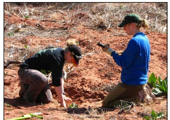
Wild Rockies Field Institute after a day of shrub planting at Jackson Bottom (left) and spring-breakers from University of Wisconsin - Steven's Point plant native shrub seedlings (right).