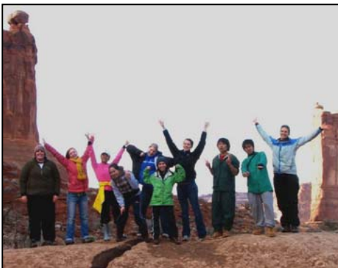
Coe college students express their joy at Arches National Park

Our Alternative Spring Break program is coming into its 16th year and is still proving to be one of the most popular services we offer. 2011 promises to bring students from as far as University of Alaska, Anchorage and Keene State, New Hampshire as well as returning schools from Iowa and Colorado.