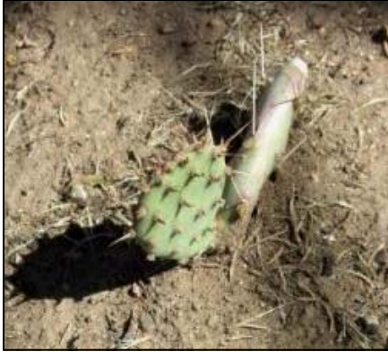
Newly sprouted pad on prickly pear "chunk" planted this spring in the burn area

After a major fire in August 2008 that burned 3600 acres of upper Castle Valley near Moab, we gained support from the National Forest Foundation (NFF) to aid the rehabilitation of the