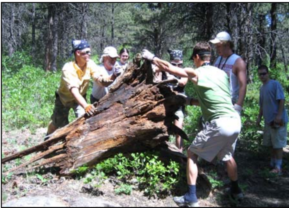
EKU students wrestle with a tree stump to block an illegal route and, above right, relaxing after signing the Trans Mountain Trail

Our accomplishments should greatly assist forest managers as they begin enacting the new forest travel plan that restricts motorized travel to legal routes and trails. This is an important first step in limiting the destruction of sensitive areas that contain vegetation critical to wildlife and the overall health of this alpine environment.