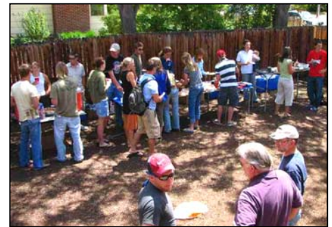
Seminar participants learn about Tamarisk beetles (top) followed by a hearty lunch (bottom)