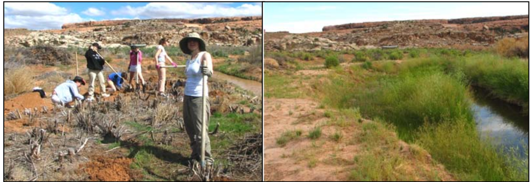
Students dig out tamarisk stumps last year (left); this year the area has been weeded and transplanted and is showing signs of recovery (right).

We are now actively seeking additional support to install a drip-irrigation system with solar pump to enhance the restoration project over the next several years.