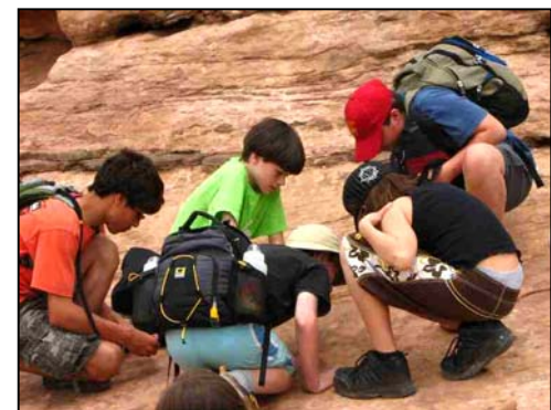
This year's youngest service-learning program participants, 7th-graders from Washington State explore the wonders of the desert.

To learn more about Plateau Restoration or to join or donate, please visit our website www.plateaurestoration.org , or contact us: P.O.Box 1363, Moab UT 84532; info@plateaurestoration.org 435-259-7733 / 1-866-202-1847